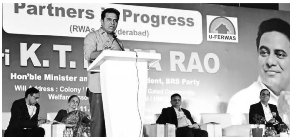
కాంగ్రెస్ సమస్య లేకుండా చేశామని తెలిపారు. బట్టి ఉద్యోగులు బీఆర్ఎస్ పాలనలో 10 అక్షరాల పెరిగారన్నారు.

సవతెలంగాణ బ్యూరో - హైదరాబాద్ హైదరాబాద్ నిరంతరం అభివృద్ధి చెందాలంటే బీఆర్ఎస్ పార్టీని గెలిపించాలని ఆ పార్టీ వర్కింగ్ ప్రెసిడెంట్ కేటీఆర్ అన్నారు.